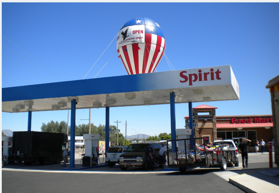
Eagle's Landing celebrated a grand opening for its newest site last June.